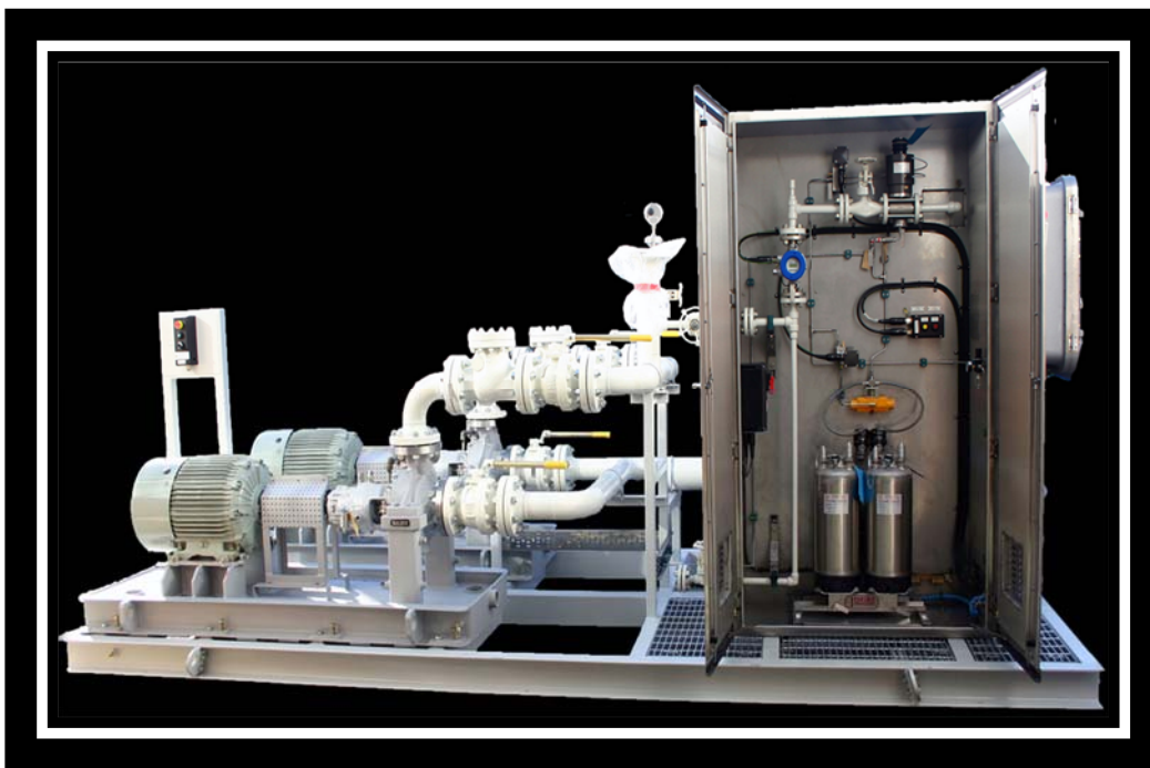
Figure 4 – Jet Mix Sampling System