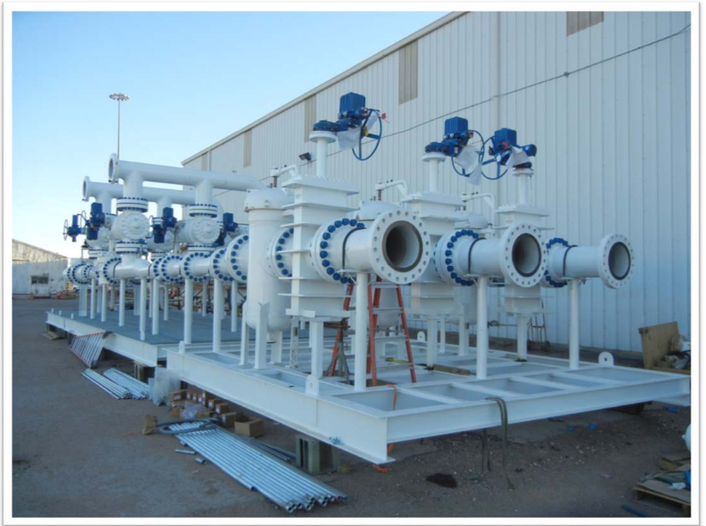
Figure 2 – Triple Turbine Meter Measurement Station