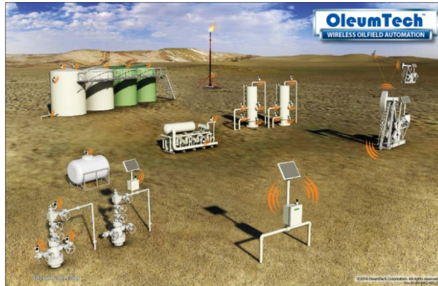
FIGURE 3. Wireless Wellpad