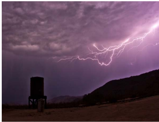
FIGURE 1. Nearby Lightning Strike

Historically, oil & gas automation has relied heavily on the direct burial of cable for signal communication from remote devices back to a central controller. This cable acts as a copper conductor for power transients (indirect lightning strikes). A majority of all automation damage is caused by indirect lightning strikes. Copper cable buried on a location acts like an antenna picking up all inducted power surges from the surrounding area.