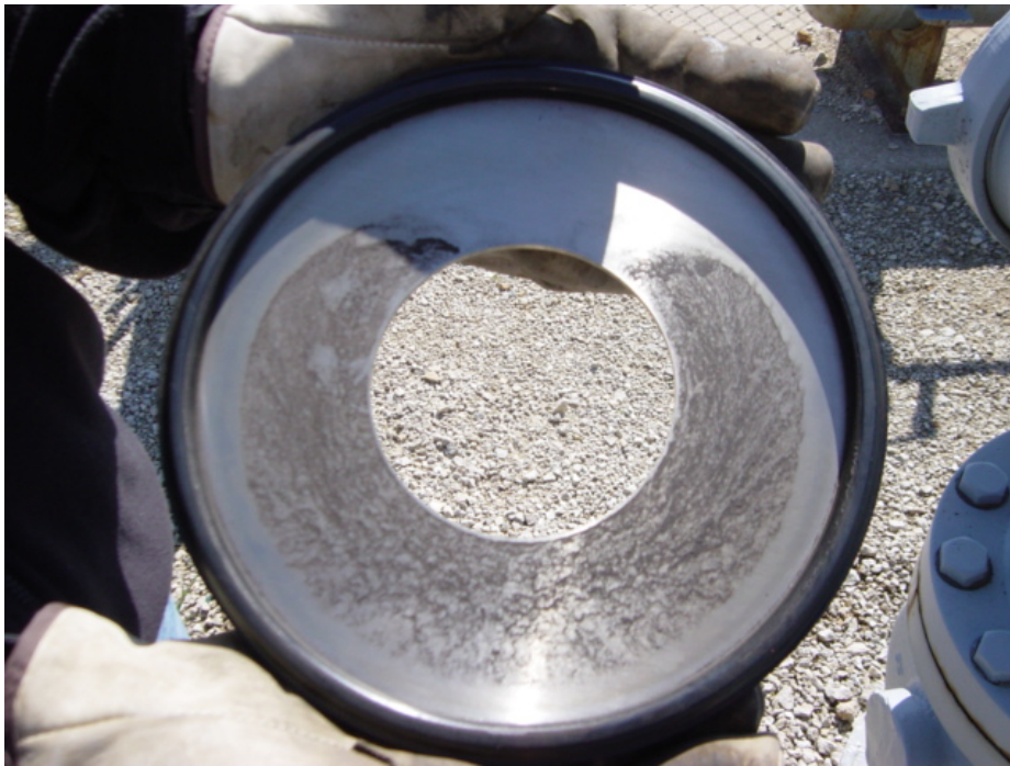
Figure 3. Picture to attach to documentation